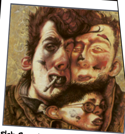
Slab Boys (Compass)