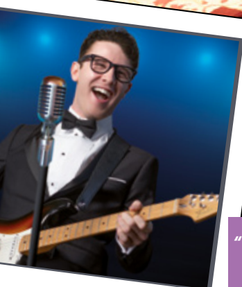
Buddy Holly and the Cricketers

"The show really did exceed all my expectations, I've seen many Buddy Holly tribute bands and this is really one of the best." Customer feedback. Buddy Holly and the Cricketers