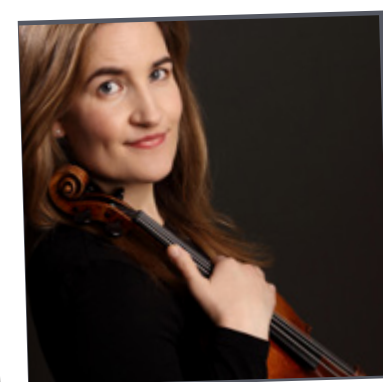
Ayr Arts Guild Concert Series

"The show really did exceed all my expectations, I've seen many Buddy Holly tribute bands and this is really one of the best." Customer feedback. Buddy Holly and the Cricketers