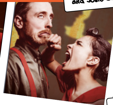
Single Shoe Productions

"A wonderful evening of fine comedy and good singing. The jokes were excellent and were heard by all" Customer feedback. The Steamie