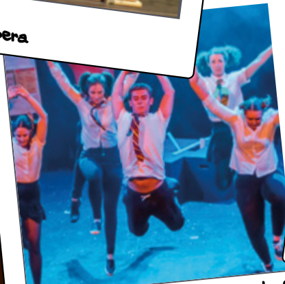
YTAS National Festival of Youth Theatre 2017