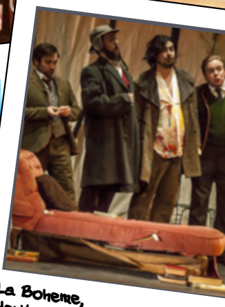
La Boheme, Heritage Opera

"Amazing! First year attending the panto at The Gaiety Can't wait to book for next year" "We, my wife and I, are enthusiastic supporters of the Gaiety and this visit gave continuing reason to remain supportive of your efforts" Customer feedback. Cinderella